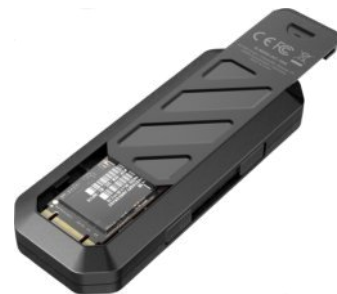
*Holder Storage for 2nd. M.2 SSD